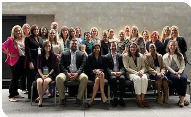
Noridian team welcomes attendees from across the country at the first NPEC since the pandemic.

The opportunity to answer enrollment questions face-to-face across organizations was praised by all.