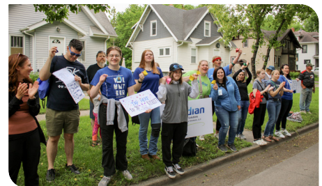
Cheering section during the Fargo Marathon

Cross Blue Shield of North Dakota to sponsor the Fargo Marathon 5K. Shown here, Noridian volunteers along with friends and family stand in our cheering section and show their support for race participants.