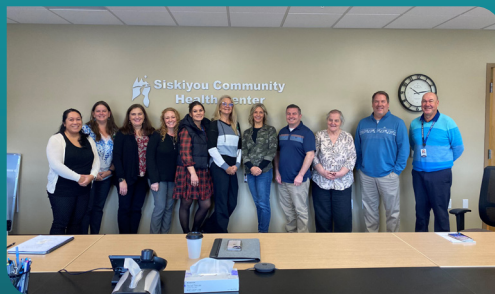
Group visit in Oregon

For the past two years, the Centers for Medicare & Medicaid Services (CMS) and Noridian have conducted face-to-face visits with rural healthcare providers to strengthen relationships and understand the unique challenges they face. These visits are crucial for building trust and ensuring that providers feel supported to help them continue to provide quality care in their communities.